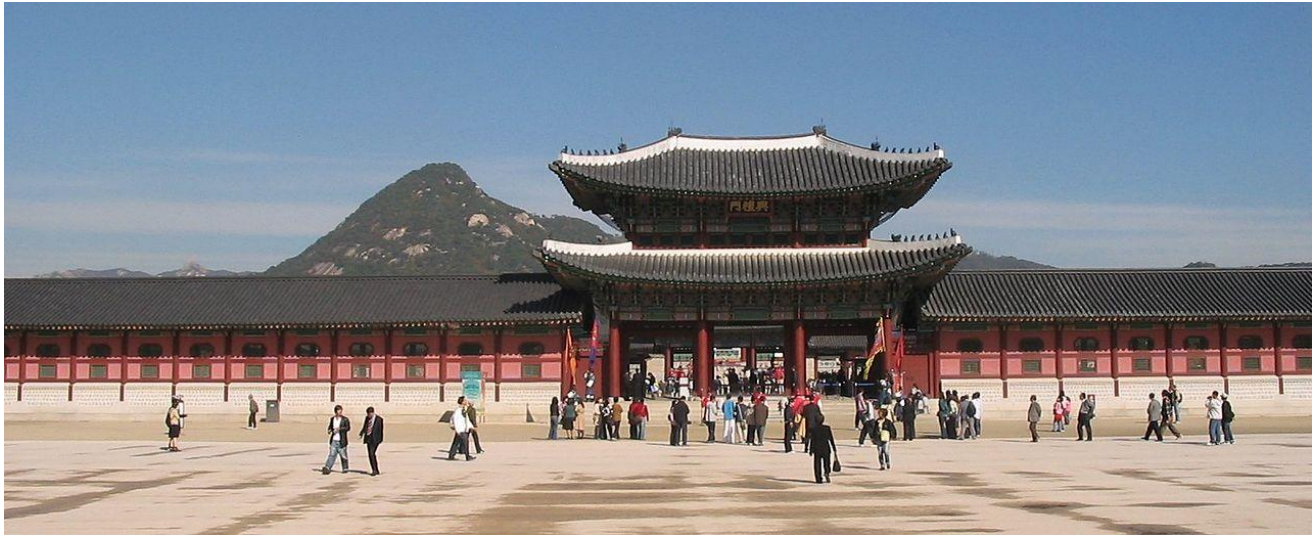
Seoul's Gyeongbokgung Palace