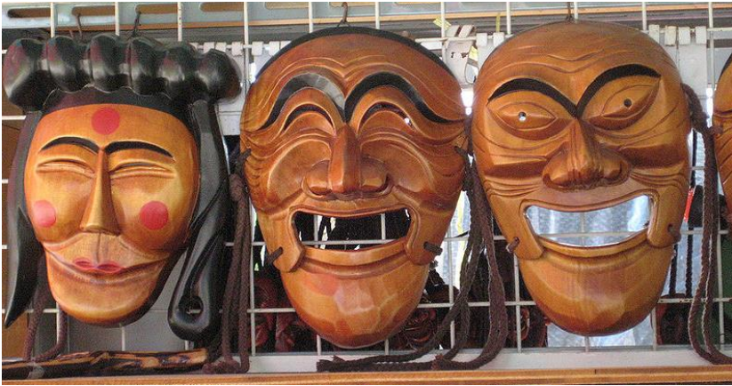
< Masks for sale at Andong Hahoe Folk Village

Gyeongju – Andong (approx. 140 kms) +/- 2 hrs. Andong – Pyeongchang (approx.. 135 kms); +/- 1 hr 45 mins.